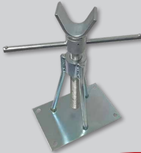
JZ-CAM05T / JZ-CAM16T